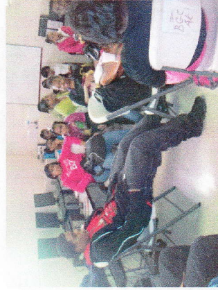
Boys & Girls Club of Northwest MS

If you are interested in learning more about financially supporting the clubs, please feel free to come by or call.